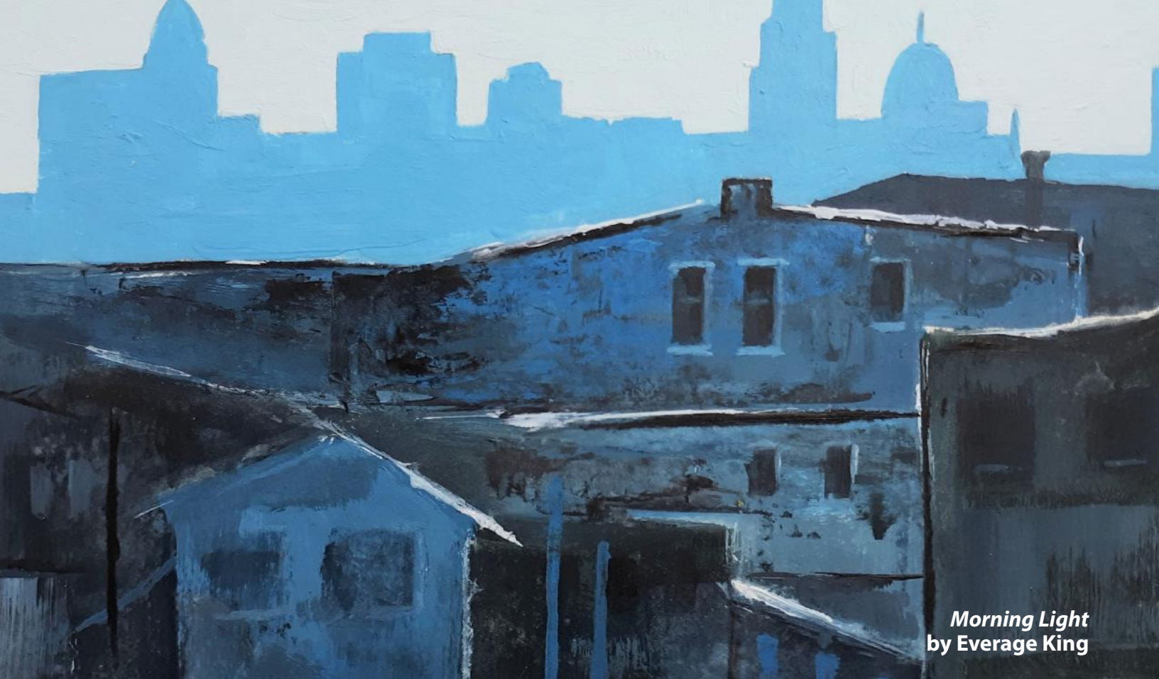
Morning Light by Everage King