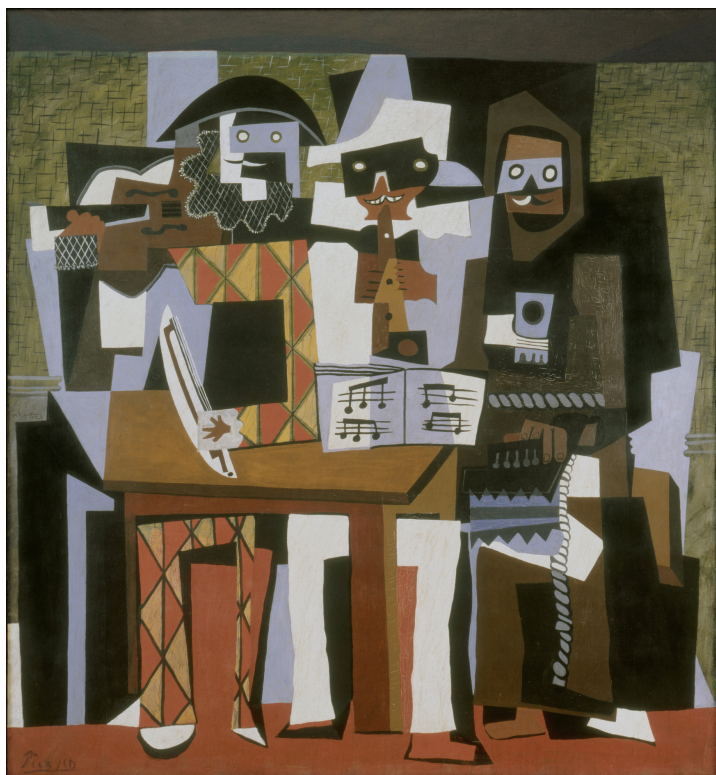
Three Musicians, 1921

One of Picasso's most famous art styles was called Cubism . Cubism is a style of art where the artist draws different parts of an image, but from many different angles.