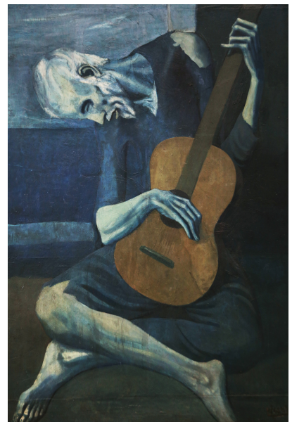
The Old Guitarist, 1903

When he was young, Picasso was able to sketch beautifully, which gave him practice and built the skills that would later make him one of the most famous artists in history. His sketches and experimentation led him to create many unique works of art that experiment with color and form.