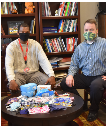
Newport Schools Mask Distribution