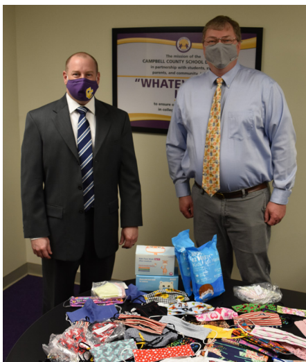
Campbell County Schools Mask Distribution