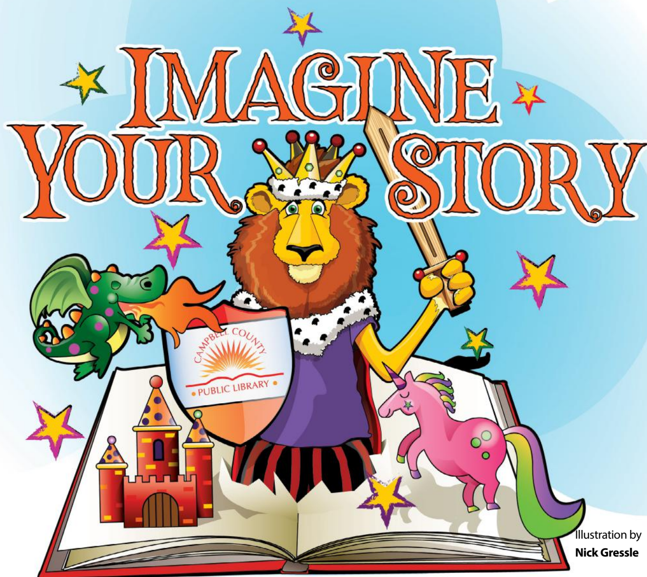
Illustration by Nick Gressle