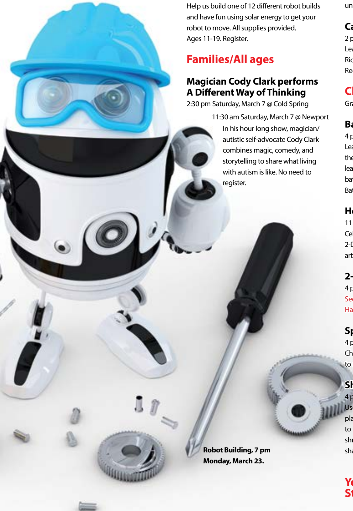
Robot Building, 7 pm Monday, March 23.