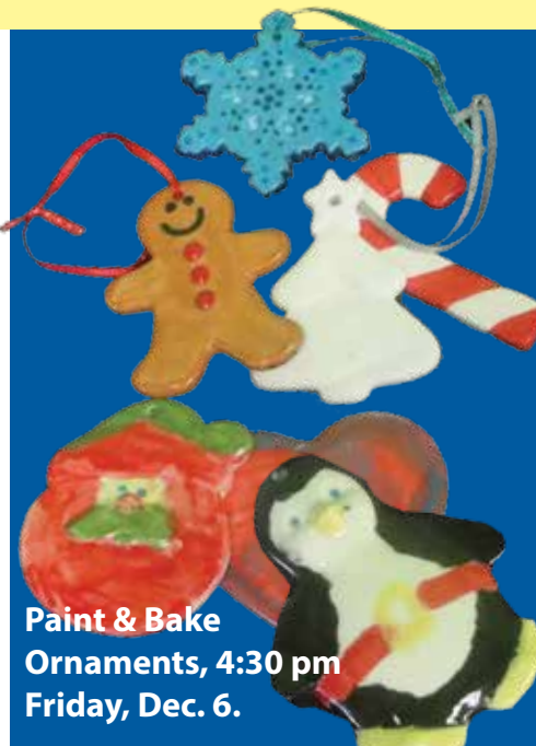
Paint & Bake Ornaments, 4:30 pm Friday, Dec. 6.

Come with your video games and cards and meet up. All ages. No need to register.