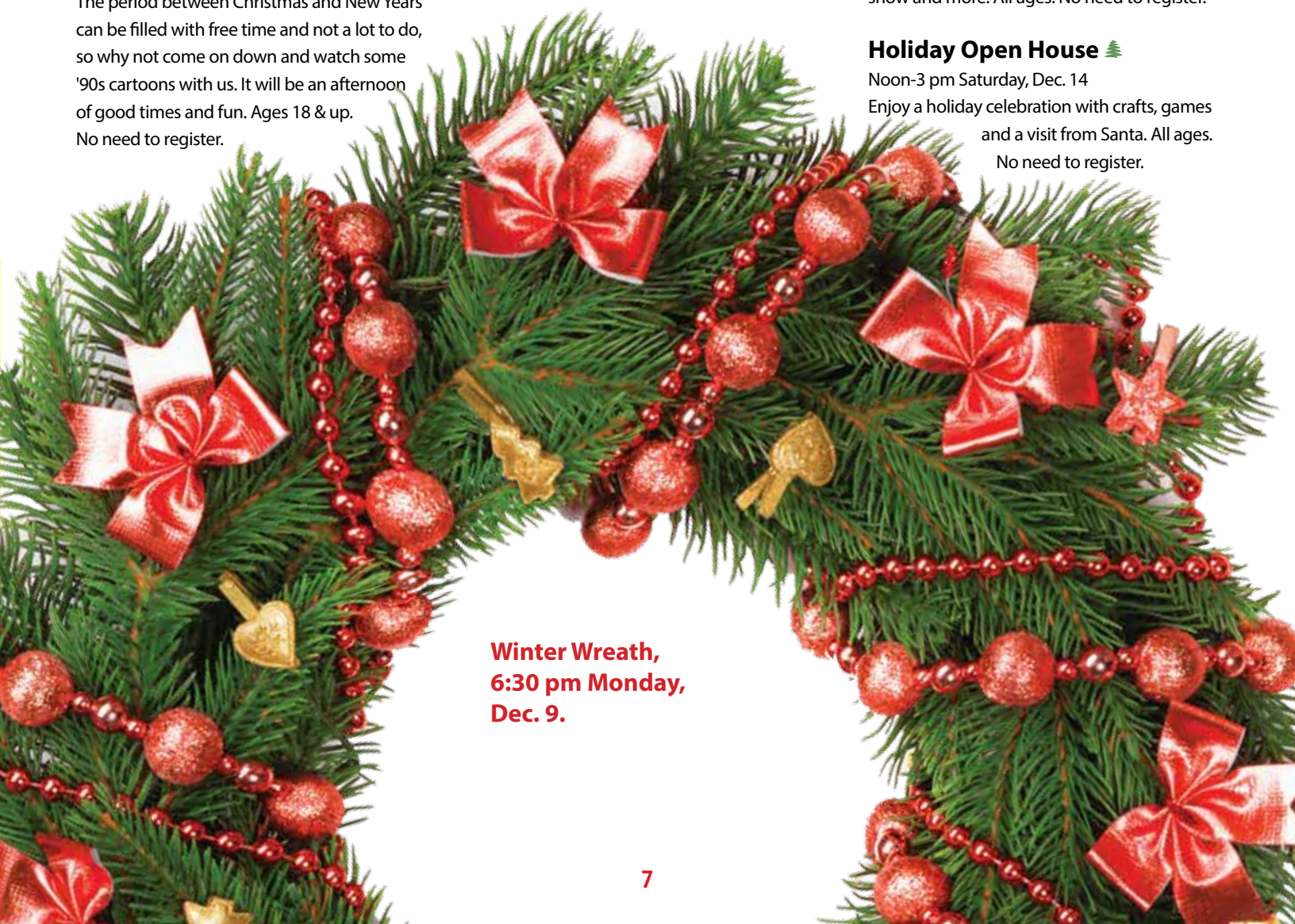
Winter Wreath, 6:30 pm Monday, Dec. 9.

Enjoy a holiday celebration with crafts, games and a visit from Santa. All ages. No need to register.