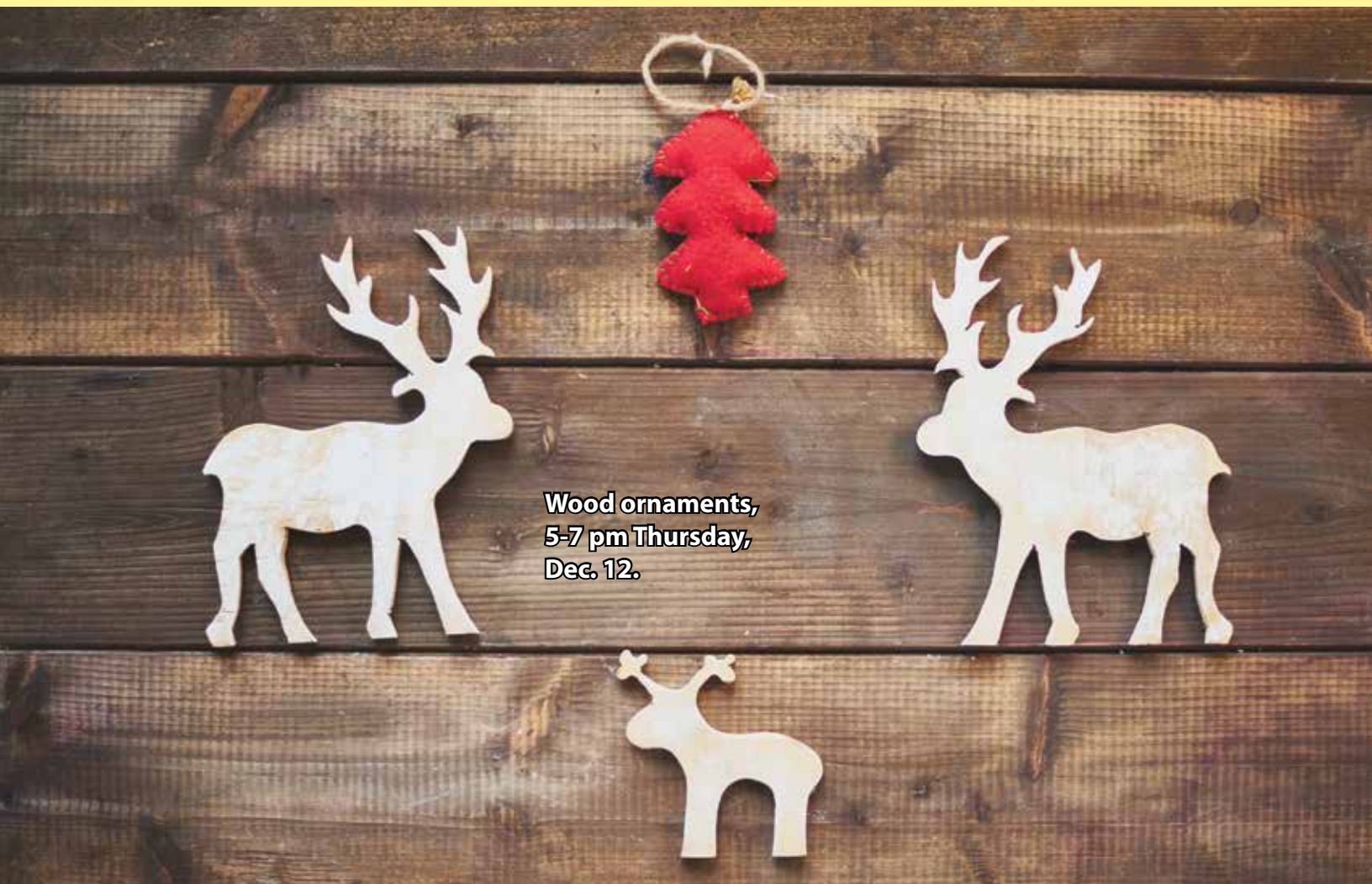
Wood ornaments, 5-7 pm Thursday, Dec. 12.