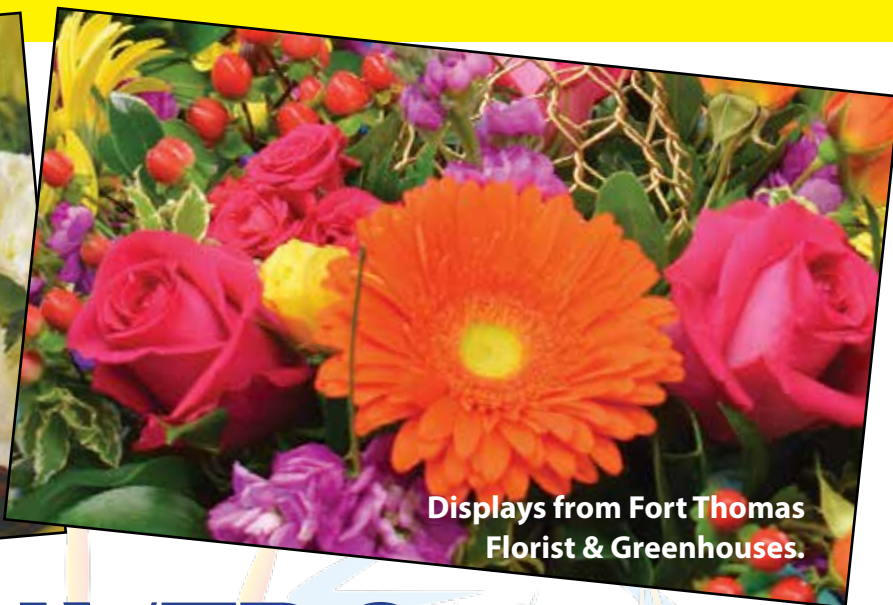
Displays from Fort Thomas Florist & Greenhouses.

A rt After Hours, the Library's Summer Reading grand finale, will celebrate the works of a diverse group of local artists 7-9 pm Friday, July 27, at Carrico/Fort Thomas.