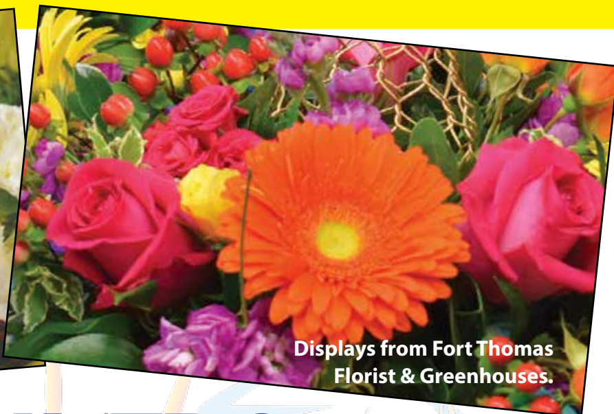
Displays from Fort Thomas Florist & Greenhouses.

A rt After Hours, the Library's Summer Reading grand finale, will celebrate the works of a diverse group of local artists 7-9 pm Friday, July 27, at Carrico/Fort Thomas.