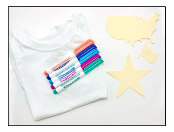
Step 1: Use the stencils and the fabric markers to create your t-shirt design. You can also skip the stencils and use your imagination!