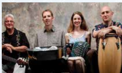
Cold Spring BACCHANAL STEEL BAND