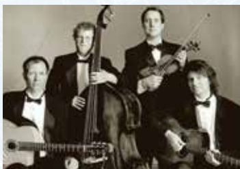
FAUX FRENCHMEN